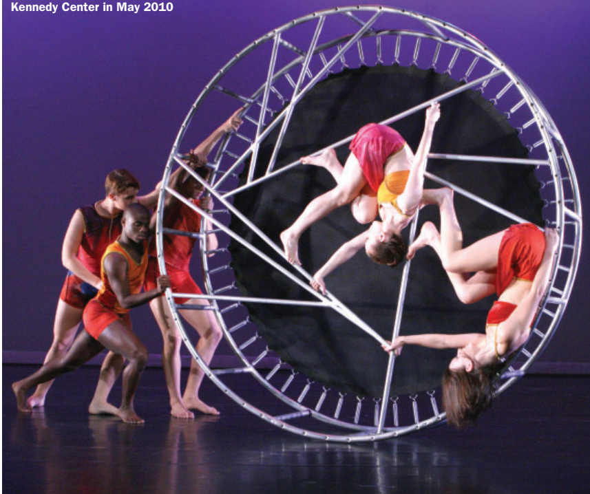
“Chakra,” performed by the KSU Dance Company at the Kennedy Center in May 2010

“It allows their company dancers to enroll in KSU’s undergraduate program and also exposes our students to the pro-